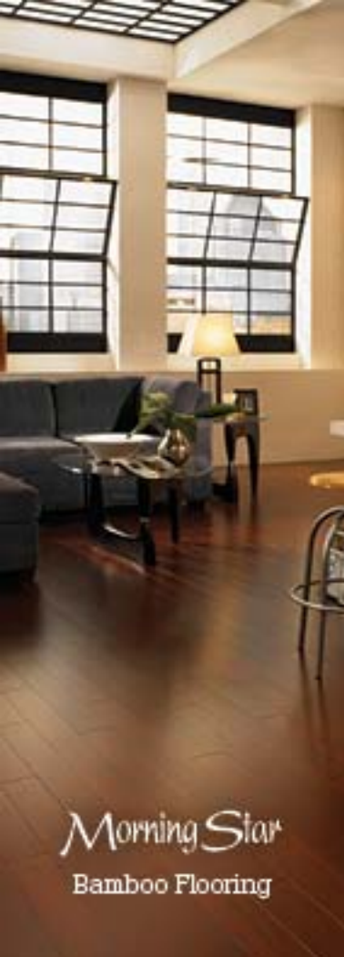
Morning Star Bamboo Flooring