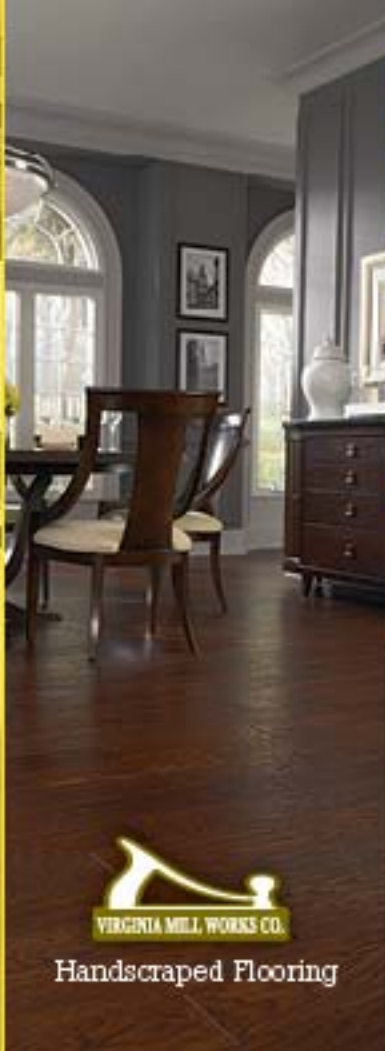
VIRGINIA MILL WORKS CO. Handscraped Flooring