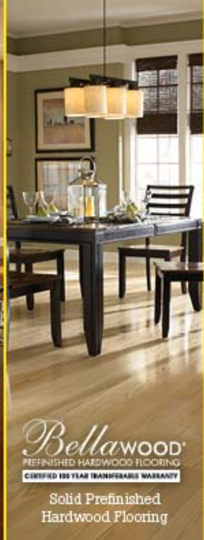
BellaWood® PREFINISHED HARDWOOD FLOORING CERTIFIED 100 YEAR TRANSFERABLE WARRANTY Solid Prefinished Hardwood Flooring